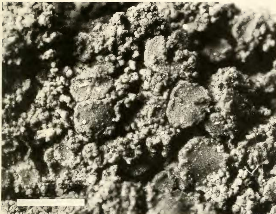
Fig. 1. Candelariella viae-lacteae (STU-Wirth 17669, Greece: Athen). — Scale: 1 mm.

Pinus sp. there are no other lichens; the specimen on the deciduous tree is accompanied by Buellia alboatra , Lecanora hagenii , Physcia biziana , Physconia grisea s. lat. and Xanthoria parietina .